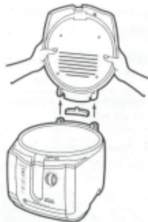
Diagram 5 Open cover 90°, lift to remove Lift condensation cup to remove

Open cover 90° and lift to remove from base. See Diagram 5. Lift condensation cup out of cover hinge area on backside of fryer. See Diagram 5.