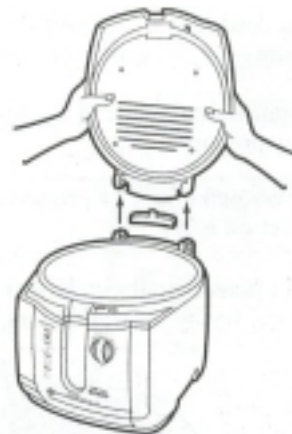
Diagram 5 Open cover 90°, lift to remove Lift condensation cup to remove

Open cover 90° and lift to remove from base. See Diagram 5. Lift condensation cup out of cover hinge area on backside of fryer. See Diagram 5.